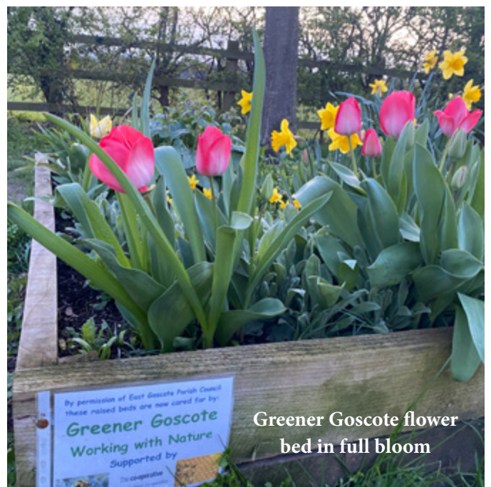
Greener Goscote flower bed in full bloom

If you would like more information, or to discuss availability, please contact: Charlotte Turlington on 0116 260 2202 or email egadmin@talktalk.net .