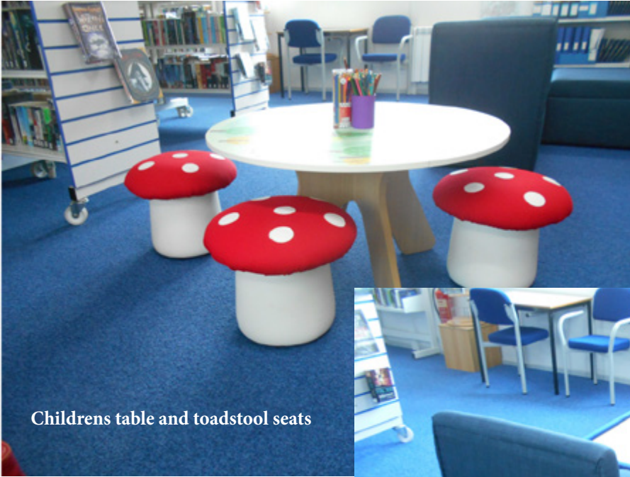
Childrens table and toadstool seats

Due to one of the developments at Queniborough, your library has been given £1900 to spend for the use of residents of East Goscote. The Trustees chose the items pictured above.