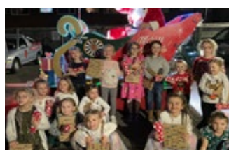
1ST EAST GOSCOTE RAINBOWS