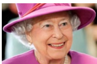
PLATINUM JUBILEE WEEKEND