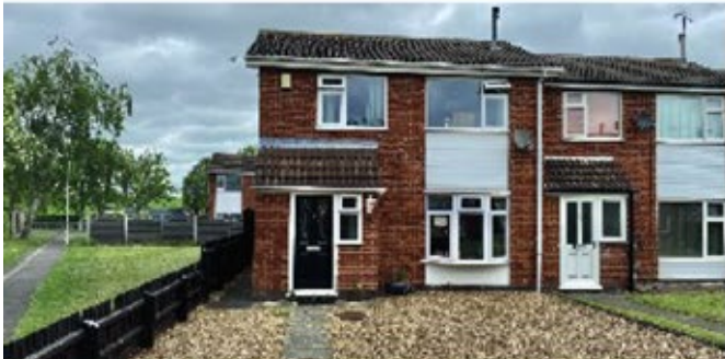
FOR SALE - Yeomans Dale