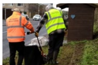
THE GREENER GOSCOTE PAGE