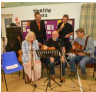
LIBRARY NEWS Page 2