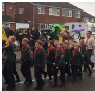
East Goscote Scout Group Page 4