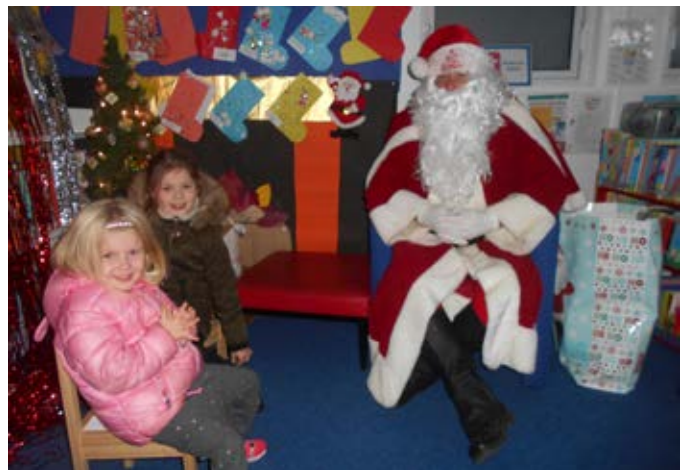
Santa giving presents to the children.