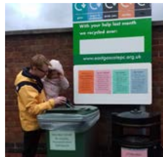
DAVID CANNON'S GREENER GOSCOTE Page 7