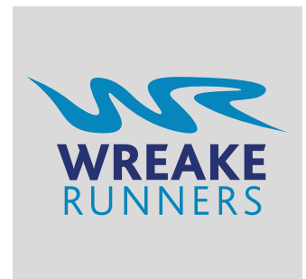
WREAKE RUNNERS. COUCH TO 5K Page 8