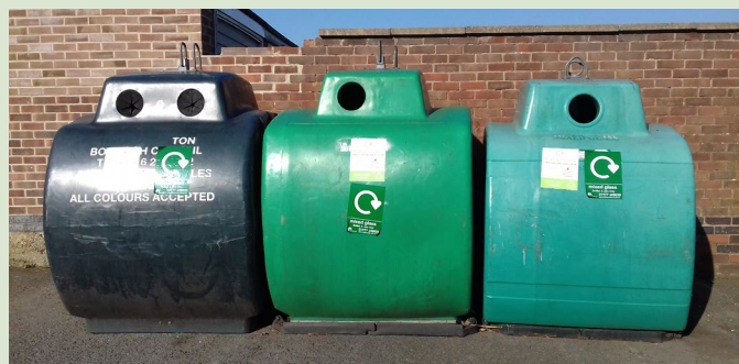
^ New Bottle Banks

www.lesswaste.org.uk www.lrrn.info www.completewasters.co.uk www.recyclenow.com www.lovefoodhatewaste.com www.leics.gov.uk www.charnwood.gov.uk www.keepbritaintidy.org