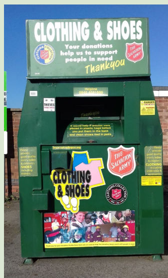
< Salvation Army Clothing Bank