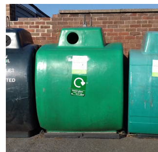
DAVID CANNON'S GREENER GOSCOTE Page 12