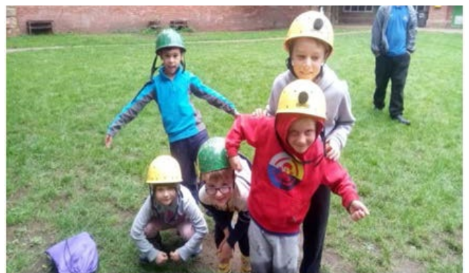
Pot holing on camp