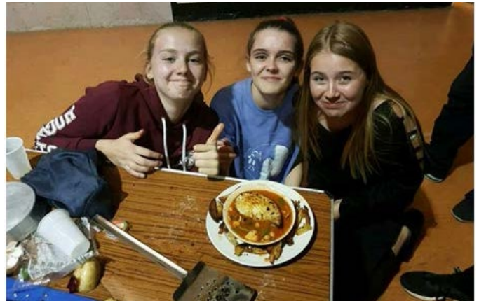
Scout Ready Steady Cook

Lots of sleepy Cubs and Beavers at the end, lots of fun had. Big well done to Wren who completed her nights away permit.