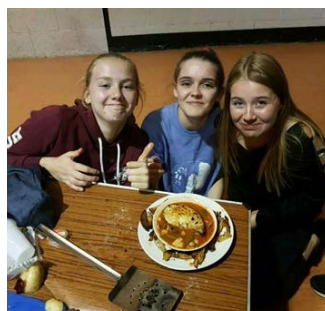
East Goscote Scout Group Page 4