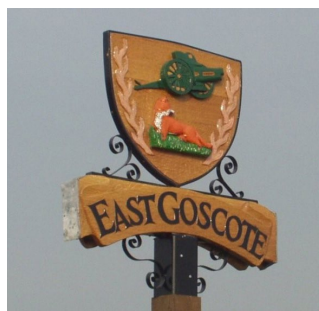
PARISH COUNCIL NEWS Page 9