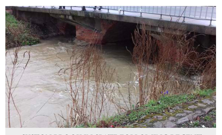
SYSTON BROOK IN SPATE FOLLOWING RECENT RAIN. FLOODING IS ONE OF MANY PLANNING CONSIDERATIONS IN OUR AREA.