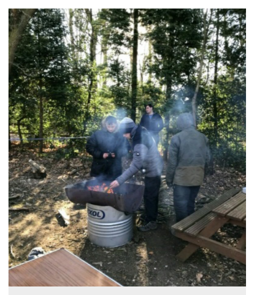
COOKING ON WINTER CAMP.