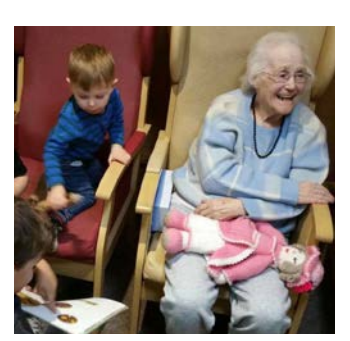
POCKET ROCKET PRE-SCHOOL Page 3