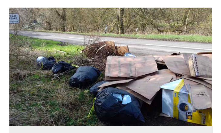
THIS APPALLING FLY TIP TURNED OUT TO BE CANNABIS RELATED!