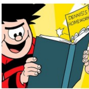
SUMMER READING CHALLENGE 2018 Page 7