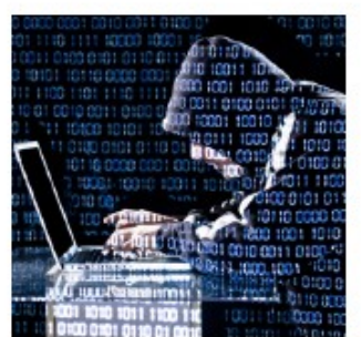
ACTION FRAUD REPORT Page 3 & 6