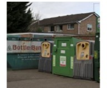
DAVID CANNON'S GREENER GOSCOTE Page 5