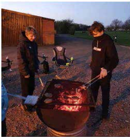
Scouts BBQ First night back 2021!

At East Goscote are doers and give-it-a-go-ers. Yes, we go camping, hiking, swimming, abseiling, cycling and shooting and more. But we also get to hang out with our friends every week, having fun, playing games, working in a team and taking on new challenges. These are just a few things we get up to at East Goscote Scout Group. If you are interested in your Child joining our group please visit our website for more information, all welcome.